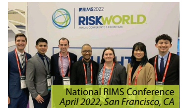
National RIMS Conference April 2022, San Francisco, CA