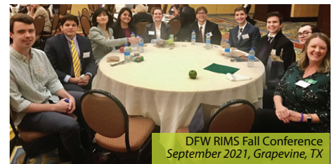
DFW RIMS Fall Conference September 2021, Grapevine, TX